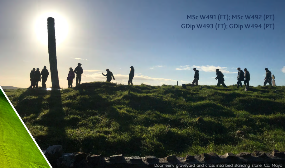
Doonteeny graveyard and cross inscribed standing stone, Co. Mayo