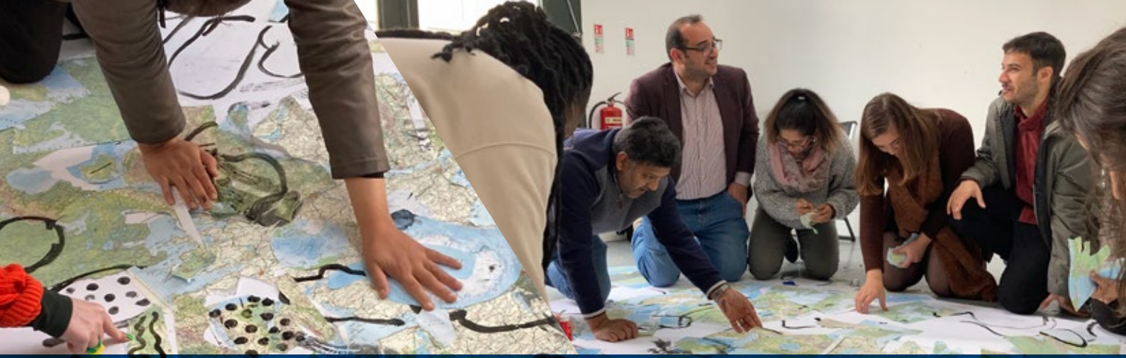
Students join the Art Nomads Collective at the Irish Museum of Modern Art for a day of world map/re/making 2022