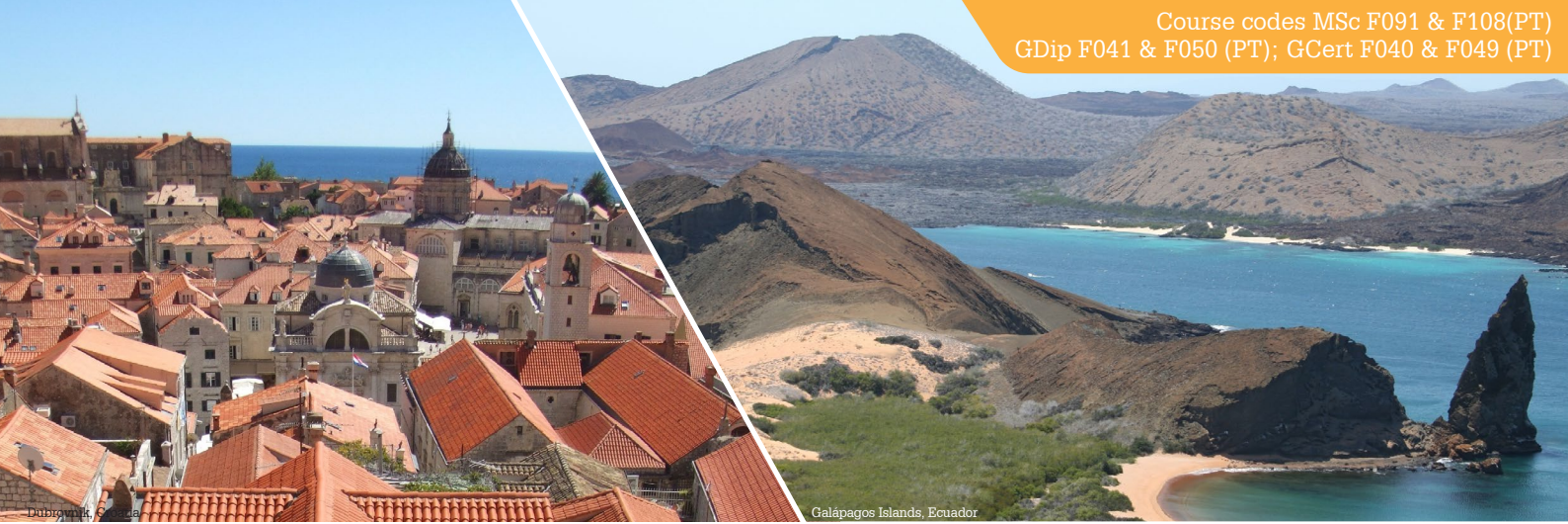
Galápagos Islands, Ecuador