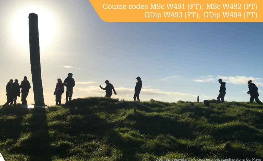
Doonfeeny graveyard and cross/inscribed standing stone, Co. Mayo