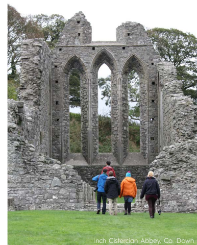
Inch Clisterian Abbey, Co. Down