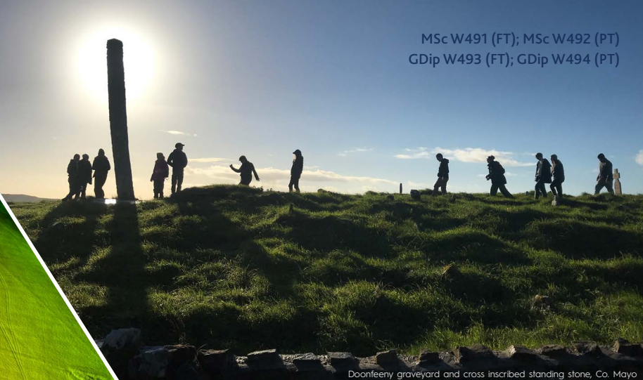
Doonteeny graveyard and cross inscribed standing stone, Co. Mayo