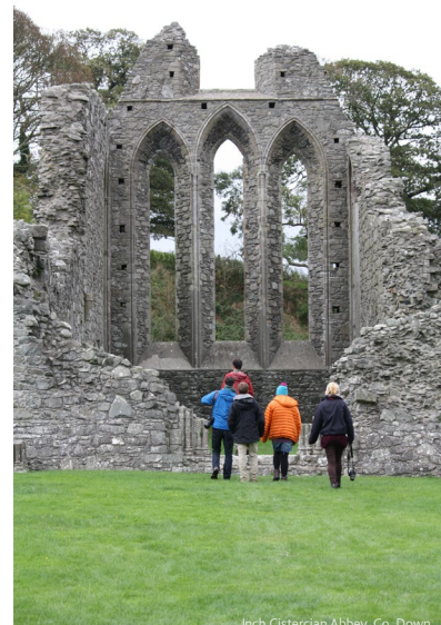
Inch Clisterian Abbey, Co. Down

Modules and topics shown are subject to change and are not guaranteed by UCD.