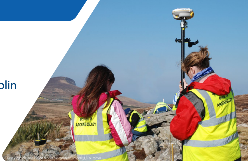
Surveying an unclassified Neolithic tomb at Belderrig, Co. Mayo

University College Dublin Ireland's Global University