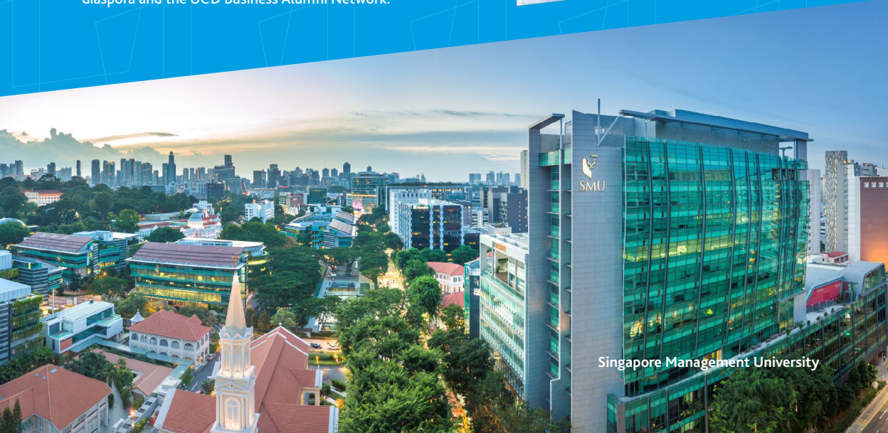
Singapore Management University