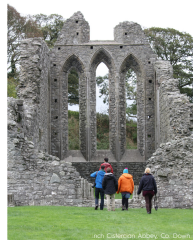
Inch Clisterian Abbey, Co. Down