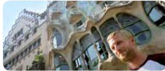
La Casa Milà [La Pedrera] in Barcelona

Spanish is a truly global language, spoken by more than 400 million people around the world. Taught through interactive language classes, Spanish is not only accessible in the initial stages of learning, it is also richly rewarding for those interested in the more advanced subtleties of linguistic study. In tandem with learning to communicate effectively in Spanish, a combination of lectures, tutorials and group work enables you to pursue your own readings of and reflections upon works by major authors, from Cervantes to Lorca, García Márquez and beyond. This will deepen your knowledge of Hispanic culture as well as sharpening your critical faculties. Opportunities will be available to study Portuguese and acquire translation skills.