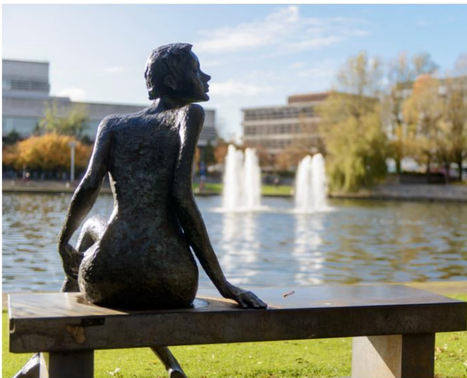
Figure 1 Rendezvous sculpture by the Belfield Lake

The MA Archives and Records Management in the School of History in UCD is an exciting degree which qualifies students to manage a range of records and archives from medieval manuscripts to born digital records. The MA programme equips students with the skills to practically care for and provide access to the historic and future memory contained in records. It also provides students with a strong theoretical foundation in the discipline, underpinning their practical knowledge with an understanding of the ethical and legal role of the contemporary record keeper.